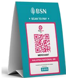
DuitNow QR standee