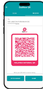
DuitNow QR generated from merchant's mobile device